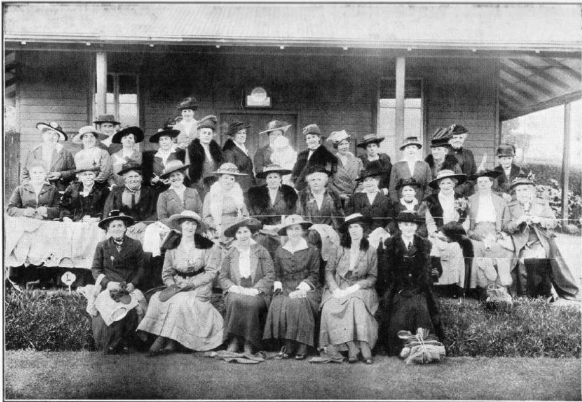
FOOTSCRAY RED CROSS AND PATRIOTIC WORKERS.