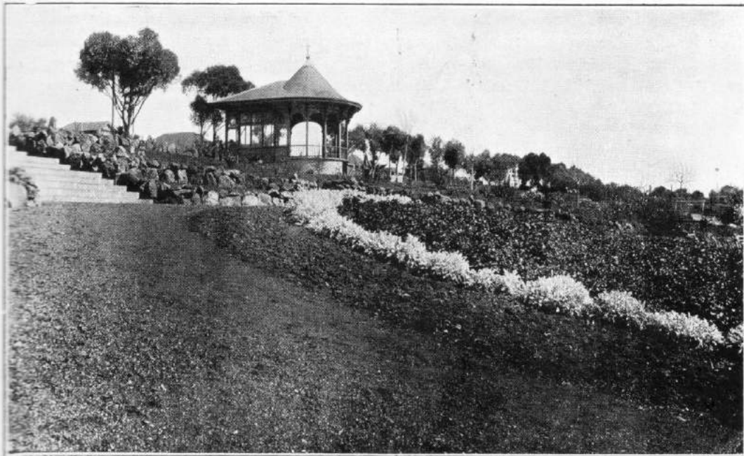
THE "BYRON MOORE" KIOSK, AND TERRACE, FOOTSCRAY PARK